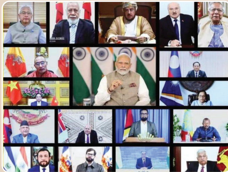
India Hosts 3rd Voice of Global South Summit on 17 August 2024